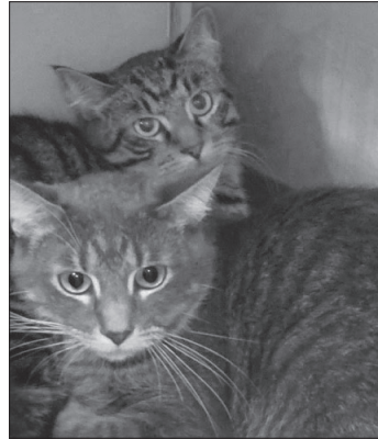
Tiger and Simpson

dog, and my human friends were concerned I would get hurt because of the dog's aggressive behavior towards me. I'm not opposed to living with a dog at all, but only if it is friendly towards cats! I love to play (maybe you saw the video of me playing with Tiger's tail – it was on StreetCats Facebook page on October 16!) and I love interacting with people. I'm not completely thrilled about being held, but I truly enjoy visiting with my human friends, following them around, and getting petted and loved on by them. Come spend some time with me at StreetCats - to know me is to love me!