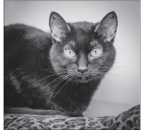
Hello, pleased to meet you - I'm Baby.

Hi! I am Baby, a black female about 5 1/2 years old. I am so sad to tell you my elderly owner died, which left me with no place to call home. Fortunately, a family member placed me and my cat companion Chase on the wait list here at StreetCats so we could find loving homes. Chase and I weren't very close, and he has already found his wonderful new home. I'm not too thrilled with other cats, so I'm hoping to find someone to fall in love with me and take me home, too! I would strongly prefer to be in a home as the only pet, and probably won't do well with children. Unpredictable sounds and motions scare me, which can cause me to make some interesting sounds myself! Being someone's sweet lap cat in a quiet home will bring out the very best in me. I really