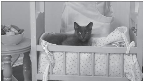
Pearl sleeps like this