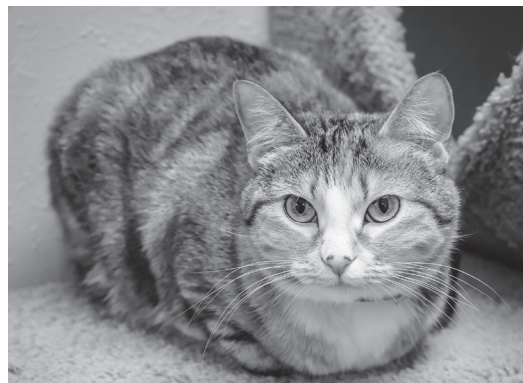
Hi! My name is Annie.

enjoy being loved on and brushed; I also love to play with a laser pointer - it is great exercise for me and not much effort for you! I had some painful stomach issues upon arriving at StreetCats. They found I had irritable bowel disease so I must be on special food and treats for the rest of my life. I'm so ready to go home with someone I trust, and to a place I can feel safe and be myself. Please come visit soon!