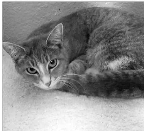
Hi! My name is Julie

Julie - I'm Julie, a beautiful petite gray tabby, just under a year old. I may be young, but I've had a lifetime worth of fear during my time on the streets. Fortunately for me, a kind homeless man rescued me and made sure I was safe. Isn't it amazing that someone in need looked out for me, a cat in need? I am so very grateful, and happy to be out of harm's way at StreetCats, but I am very frightened right now. If you give me time to get accustomed to all the changes, I really do love to be touched - I can't keep from purring when the volunteers