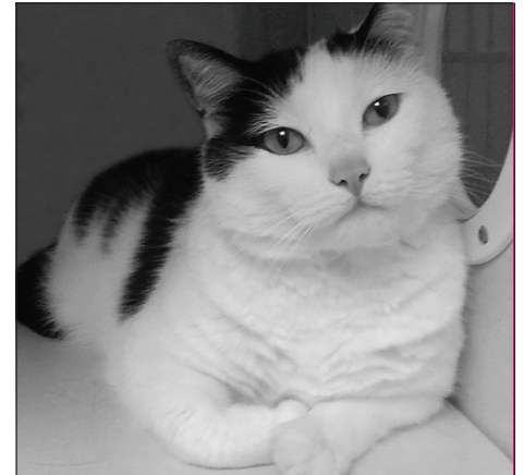
Hello everyone, I'm Daisy

Daisy - Hello, my name is Daisy. I'm a lovely black and white female, about 7 years old. When I was a kitten, I found my way to StreetCats and my mom adopted me soon after I arrived. I am heartbroken to tell you that my mom recently passed away, and my world has changed so quickly. I am accustomed to being in a quieter home with one person; being a little older now myself, I would likely be happiest in a similar home. I've been adapting to all these life changes while at StreetCats: I've relaxed a bit with the other cats and have really enjoyed all the love and attention the volunteers give me. I don't get much of an opportunity to play in the shop because I'm so cautious around the other cats, but when I feel safe I love to play! I can't wait to share with you my charming personality - won't you give me a chance at a new, safe and loving forever home?