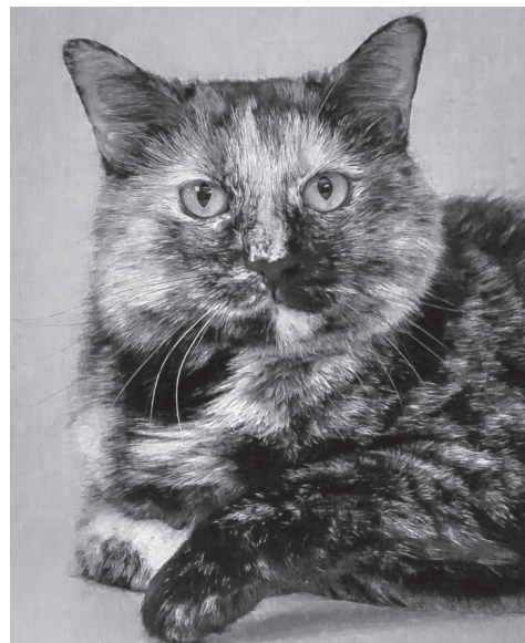
Hi! My name is Monkey

My name is Monkey and I am a beautiful full-figured 3 year old tortie. My story is like so many. I was on the streets when I was young until a very nice older couple took me in. Sadly, my adopted mom died and my dad could no longer keep me, but fortunately he got me to StreetCats and I found a new home with a very nice young man. However, a few months later his circumstances changed and he could no longer keep me. His mother kindly took me in but her kitty chased me around and it wasn't good. Therefore, she got me back to